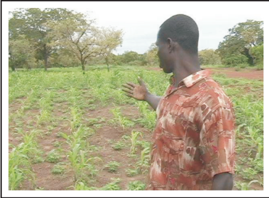
Figure 2. Farmer showing maize planted without animal manure. Picture taken August 2009.