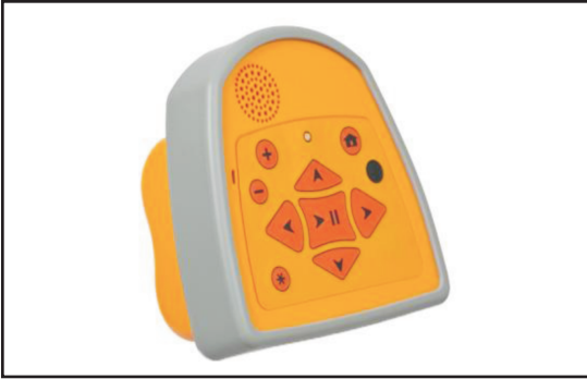
Figure 1. The Talking Book.

digital player called the Saber, which is designed for rural use (Global Recordings Network, 2010). Its audio can be updated from a computer, but it has no microphone for direct recording. Its price puts it out of reach of individual ownership; the bulk purchase price is US$45 each for missionary use and US$65 for other uses. Commercial digital recorders fall into a similar price range and are less robust (e.g., http://www.olympusamerica.com ).