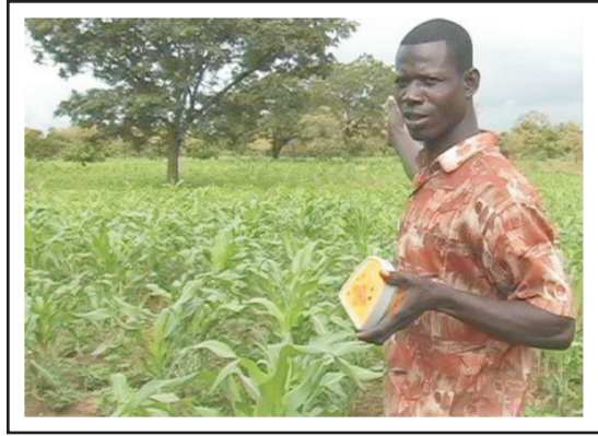
Figure 3. Farmer showing maize planted with manure obtained from confining his animals, as instructed on the Talking Book. Picture taken August 2009 (same day as Figure 2).

Based on these interviews, we believe greater impact and equal distribution could have been achieved by working with a more diverse group of users to market the program. Instead, the pilot program relied on the committee to spread the word. Although the committee as a whole was representative of the community’s demographics, in terms of gender, education, and geography, the most active members were not representative.