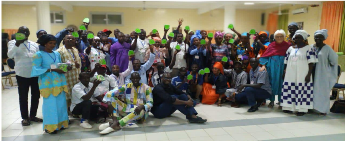
Pictured: Tostan facilitators pose with Amplio Talking Book devices.